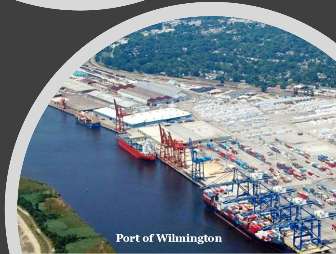
Port of Wilmington